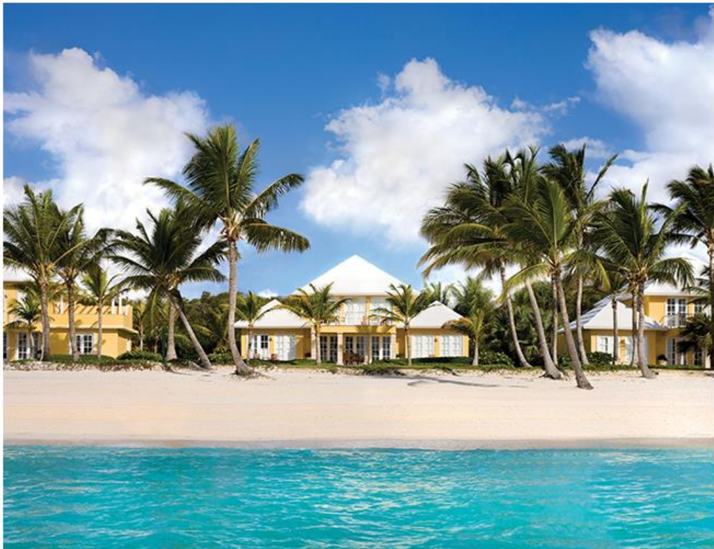
Tortuga Bay Beachfront Villas

If you're coming from the east coast, most major airports have direct flights to Punta Cana. It's a quick 4-hour flight from NYC - winning! Not only is it an easy travel day, but Punta Cana Resort & Club offer a service where an escort from the resort greets and walks you through the airport to avoid all custom lines. It truly is a VIP service unlike any other! Not to mention, the airport is a mere 10 minutes from the breathtaking Punta Cana Resort & Club - you'll be in your swimsuit at the pool in no time!