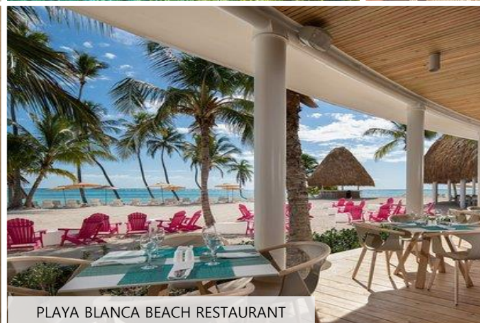
PLAYA BLANCA BEACH RESTAURANT