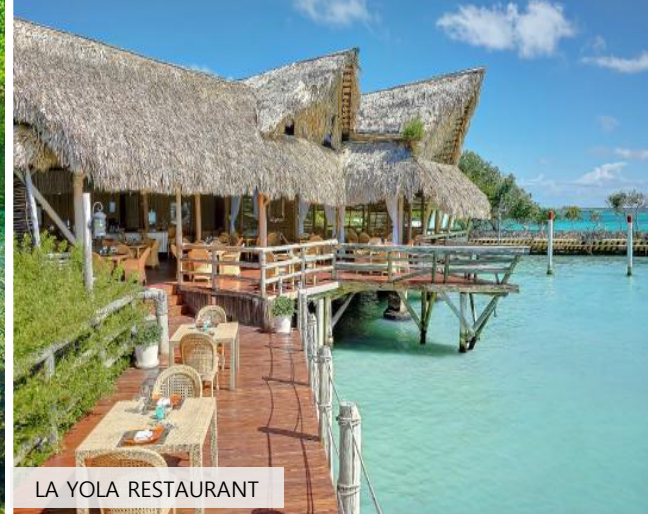
LA YOLA RESTAURANT