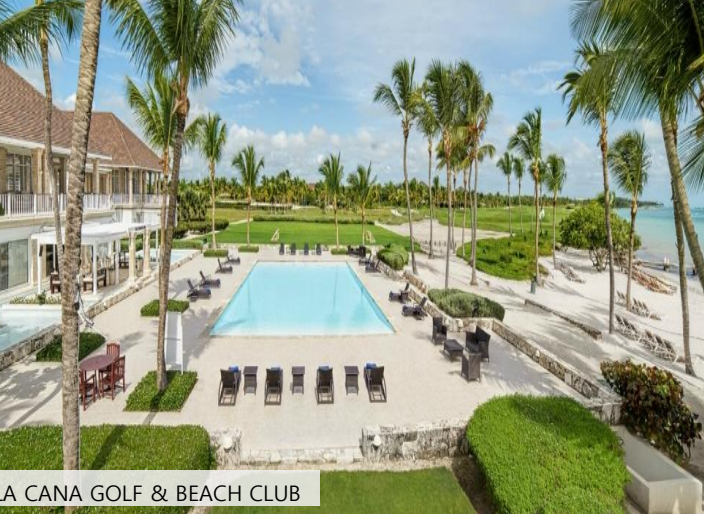
LA CANA GOLF & BEACH CLUB