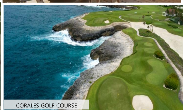
CORALES GOLF COURSE