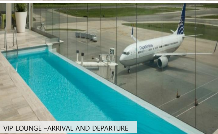
VIP LOUNGE –ARRIVAL AND DEPARTURE